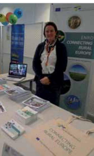
© Helpdesk of the Evaluation Expert Network